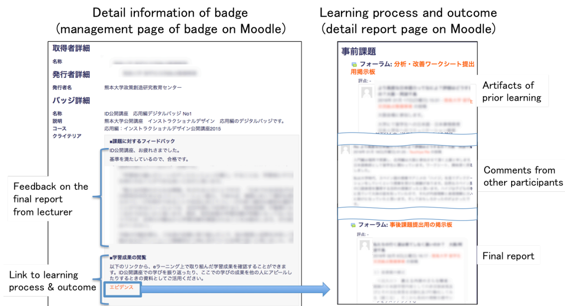
Figure 3. Function of the digital badge using default tools of Moodle